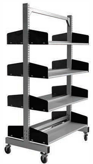
DOUBLE SIDED BAY WITH MOBILE CASTORS