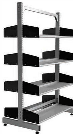
DOUBLE SIDED BAY WITH ADJUSTABLE FEET

SHELF RELOCATION Change shelf positions with ease in just a few minutes. Shelves can even be relocated without the removal of books.